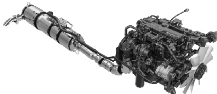
FUEL EFFICIENT E494 ENGINE WITH CIGAR TYPE EATS

Eicher Uptime Centre for 24x7 support by specialists. GPS enabled service vans just a phone call away. Remote Diagnostics for quick repair of BSVI vehicles.