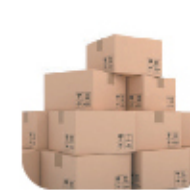
Parcel & Courier